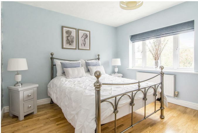
Bedroom Three 10'8" x 10'7" (3.25m x 3.23m)

A double bedroom with a window to the rear aspect, oak laminate flooring and a radiator.