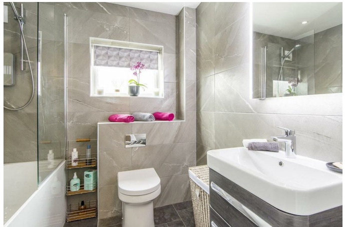
Bathroom 7' x 6'1" (2.13m x 1.85m )

Fitted with a modern back to wall WC, square hand wash basin set onto a bespoke drawer unit, a double ended bath tub with a electric shower over and side screen. Ceramic wall tiles, Karndean flooring, chrome heated towel rail and an opaque window.