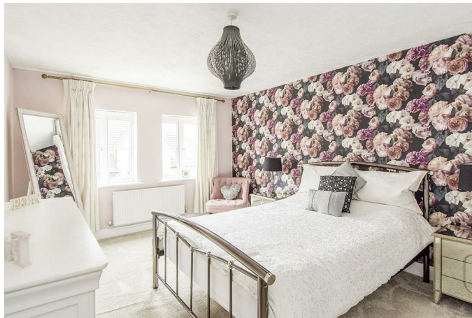
Master Bedroom 15' x 10'8" (4.57m x 3.25m)

A generous double bedroom with dual aspect windows to the front, a radiator and a wide range of bespoke fitted wardrobes. A door opens into the En-suite.