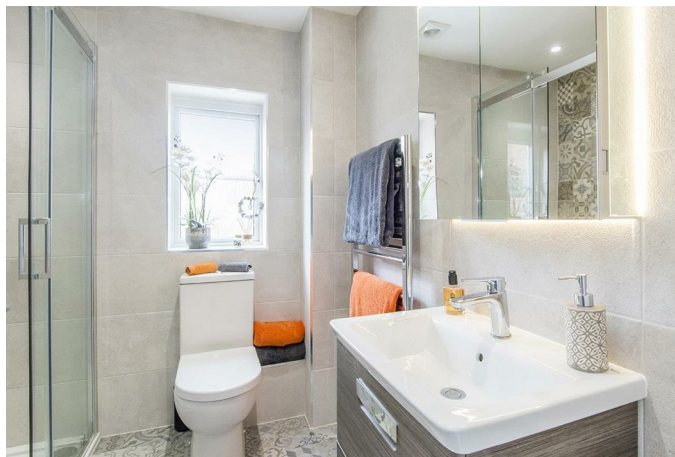
En-Suite 7' x 6'0" (2.13m x 1.83m)

Fitted with a modern back to wall WC, square wash hand basin set onto a bespoke set of drawers, double width shower enclosure with sliding doors, attractive mosaic ceramic wall and floor tiles, heated towel rail and an opaque window.