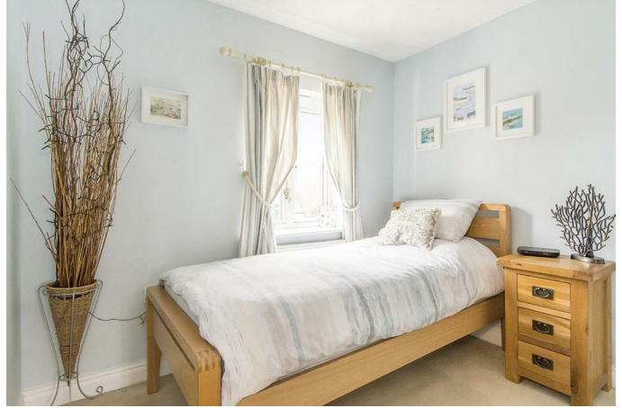
Bedroom Four 8'7" x 7' (2.62m x 2.13m )

A single bedroom with a window to the rear aspect, radiator and a built-in wardrobe.