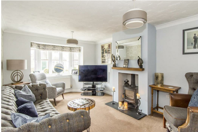
Sitting Room 17' x 10'8" (5.18m x 3.25m)

The bay-fronted sitting room has a wood burning stove set onto a slate hearth with an engineered timber mantle over. A set of double doors open into the dining kitchen.