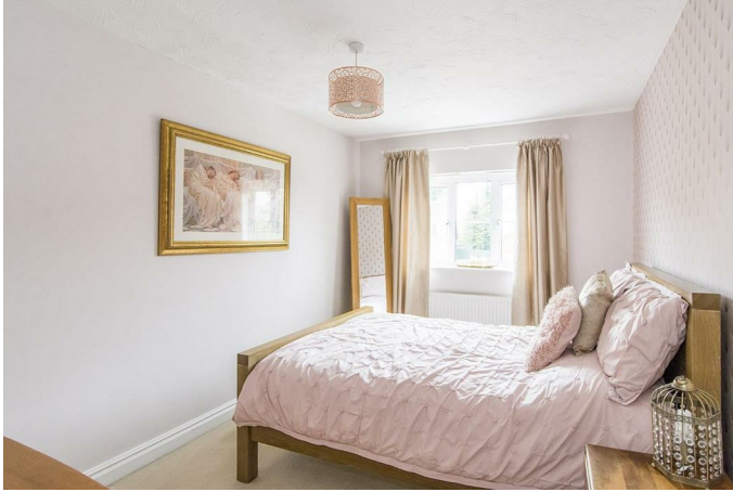
Bedroom Two 12'11" x 8'8" (3.94m x 2.64m)

A double bedroom with a window to the front and a radiator.