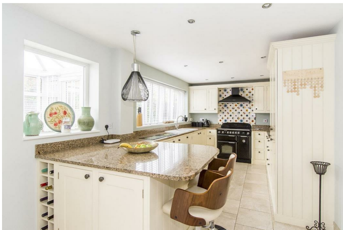
Kitchen/ Dining Room 27'5"max x 12' max (8.36mmax x 3.66m max)

With under-floor heating this spacious dining kitchen is the heart of the home and is fitted with a wide range of modern cream cabinets with complimenting granite surfaces. Porcelain bowl and half sink with mixer taps. Rangemaster Electric oven with extractor canopy over. Integrated fridge -freezer and dishwasher. Breakfast bar seating area with granite surface. The dining room is open-plan to the kitchen and is the ideal space to entertain friends and family. Dual rear aspect windows and a door opens into the conservatory.